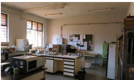
UNZA main campus